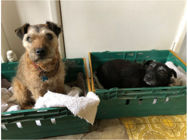
Pippin and Digby