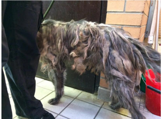
Jake when he first came into RSPCA care, above, and enjoying his new life

We put him up for rehoming and that prompted a call from a lady who had lost her Lurcher, Murphy, four years earlier whilst out on a walk. She had never given up on the search for him and when she saw Jake's photo on our facebook page she thought Murphy had been found. The dogs were almost identical – but Jake had a different microchip number. She could not stop thinking about Jake so came for a visit and set her mind at rest.