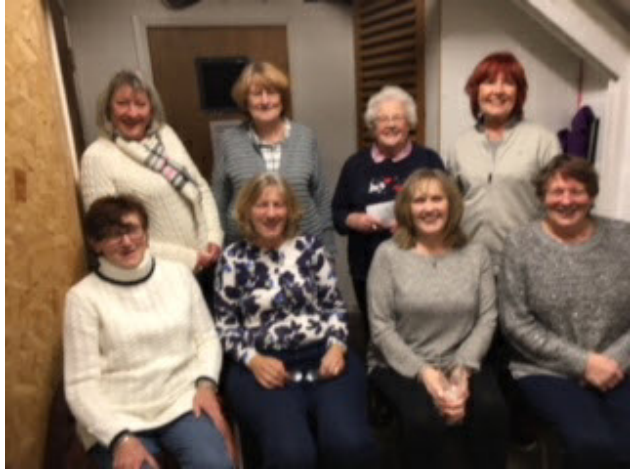
The squad at Blagdon

Skittles After our close shave in Hatch we met West Buckland at the Victoria Arms in Wellington. After a warm welcome we played our best match and we went on to win by 6 pins. This gave us the confidence to face our next opponents, Kingston St Mary. We were feeling very confident and excited about this 3rd round tie at the Lamb and Flag.