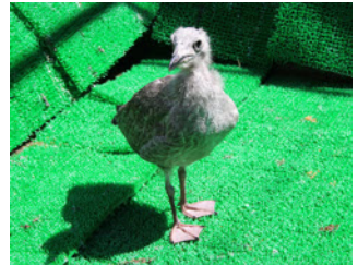
A rescued juvenile Herring Gull

Herring gull - 632; Hedgehog - 525; Wood pigeon - 333; Mallard duck - 323; Manx shearwater - 303; Feral pigeon - 183; Blackbird - 145; Rabbit and Carrion Crow - 99; Mute swan – 86