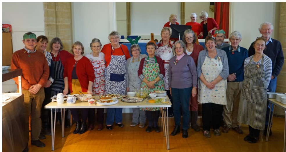
The hard-working team behind the superb Neroche Christmas Lunch