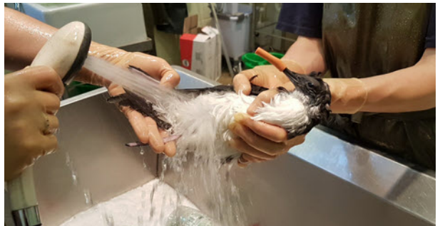
Washing a Manx Shearwater

The birds arrived at the centre exhausted and battered but our fantastic team worked long days to ensure every bird was given the best possible chance. Manx Shearwaters do not eat in captivity so staff had to tube-feed hand-made fish soup to each individual up to four times a day. When the birds had gained weight and fitness they were washed, dried and put out on a pool before being released back into the wild.