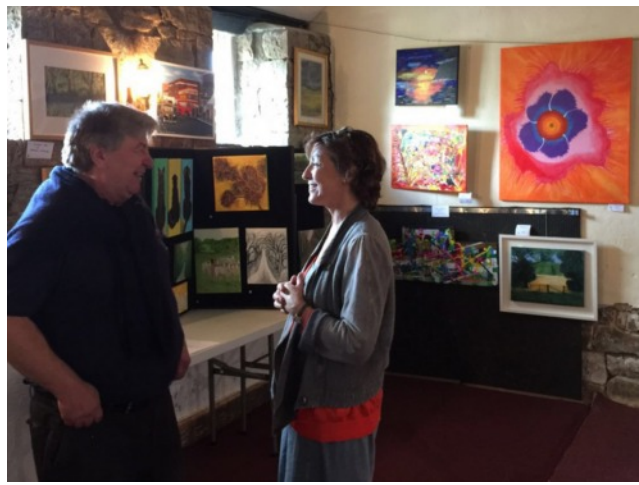
Visiting the Greyhound Art Group

Art in The Area. What an arty lot we have salted away in the countryside locally! Many talented artists took part in the popular Somerset Art Weeks, and I very much enjoyed perusing the exhibition by the Greyhound Art Group in the Greyhound Inn. As a patron of 'Art Taunton' I am working with key stakeholders to expand the cultural offer in the area and this network of local