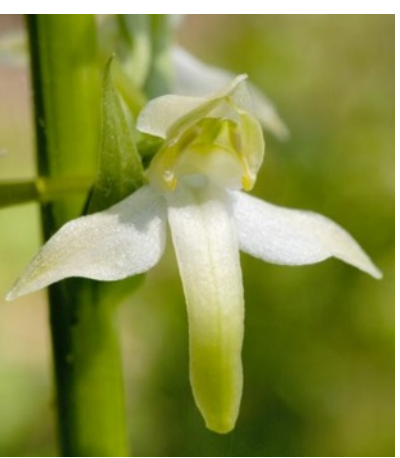
Greater Butterfly Orchid

Over the coming year we will be running a series of events to search out as many species of all kinds that we can, in a Lottery-funded project called 'Meet the Neighbours'. Look out