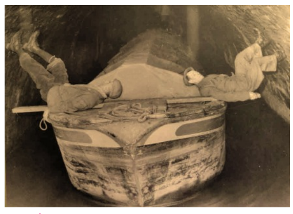
'Legging' a Canal Barge through the tunnel

forty years earlier. Fascinated, we peered carefully around the heaps of stone and soil into the gloom, yet were unwilling to venture further for fear of disturbing the obviously unstable roof. Our unidentified predecessor had not been thus deterred; the canal bed rose clear of the water at this point and it held