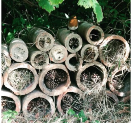
A bug hotel that Mary made using old Victorian drainage pipes

Gardening is always long-term and ongoing and though some 'quick fixes' can