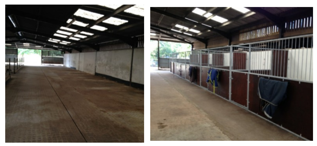
The Stable Yard

Gaynor took over the Bickenhall Farm Yard lease in July this year and, having been lying empty for several months, nature had taken over so there was an enormous amount of work to do before it could be used as a livery yard again. The arena has been overhauled and brought back to the original fence line and now has a top class riding surface. Cattle were brought on to the fields, by a kind local farmer, to eat the overgrown grass; topping was done, fences put up, water-troughs put in, hedges trimmed and cleaning and painting done! Bickenhall Farm Livery is now ready for the winter and the horses, just! Gaynor offers her apologies if your summer barbecues were interrupted by the drone of the pressure washer; enough noise was made for all the neighbours to know that a lot of work, clearing up and renewing things was going on.