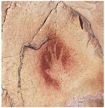
Hand silhouette photo -Hand from Le Chauvet Cave c. 28,000 BCE

The appellation 'graffiti' is usually conferred with a negative connotation; denoting a painting or carving which essentially says, 'I was here', in a form not appreciated by others. One of the earliest examples of the art survives as the silhouette of a hand on a cave wall in Le Chauvet in southern France. It was created thirty thousand years ago by a tall man who spat a mouthful of red ochre over his extended fingers, and can be seen to this day.