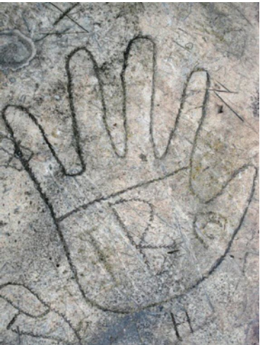
Hand outline from St Thomas's Thurlbear

This newsletter does not seek to encourage queues of penknife-bearing parishioners at